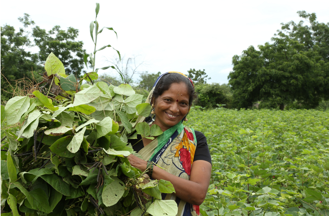
A woman farmer in Dhule, Maharashtra, India.

I think these are some of the ways that humanitarians can help, not just the World Food Programme but NGOs, UNICEF, and many other organizations throughout the world, who are trying to support women. An interesting headline in the New York Times yesterday was 'In the COVID emergency you can have a kid or a job, but you can't have both'.