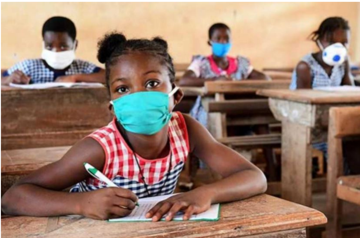
Women and girl children face quadruple impact of the COVID-19.